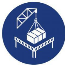
Safe Mechanical Lifting