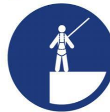
Working at Height