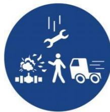
Line of Fire