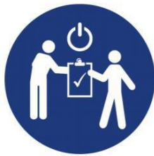
Bypassing Safety Controls